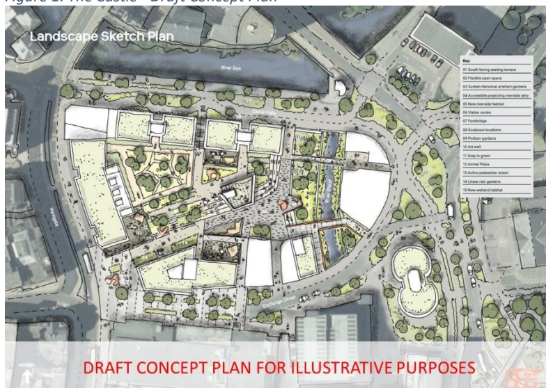
Figure 1: The Castle - Draft Concept Plan

The Castle project will re-establish Castlegate as a thriving part of the city centre. The River Sheaf will be de-culverted and complemented by new green space and public realm. Land will be readied for future development and activated by 'meanwhile uses' that encourage healthy lifestyles and reposition Castlegate as a desirable place to live, work, visit and invest.